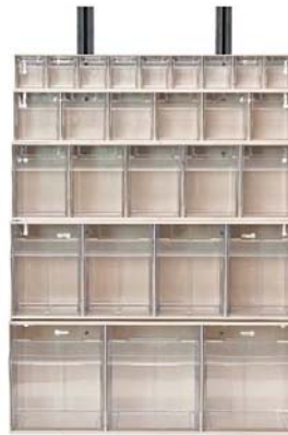
Utilize rails when base of the first bin will sit on the floor