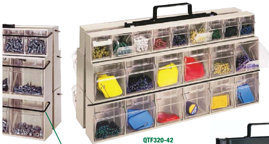
QTF320-42 Complete Frame System with Bins