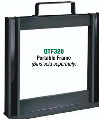
QTF320 Portable Frame (Bins sold separately)

Frame and Locking Rod available in: ●Black