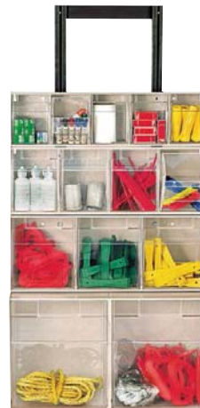
Utilize frame when bins will be mounted above floor level