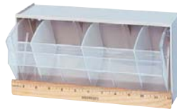
QTB410 QTB410 is a one bin design, 12" wide Each QTB410 comes with 3 DIV400 clear dividers*