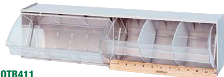
QTB411 QTB411 is a two bin design, each bin 12" wide Each QTB411 comes with 6 DIV400 clear dividers*