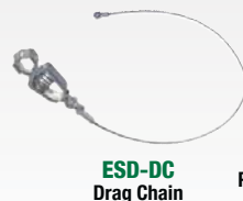
ESD-DC Drag Chain

CONVERT STANDARD WIRE SHELVING INTO CONDUCTIVE SHELVING WITH THESE ACCESSORIES THAT ARE INCLUDED WITH THESE PACKAGES