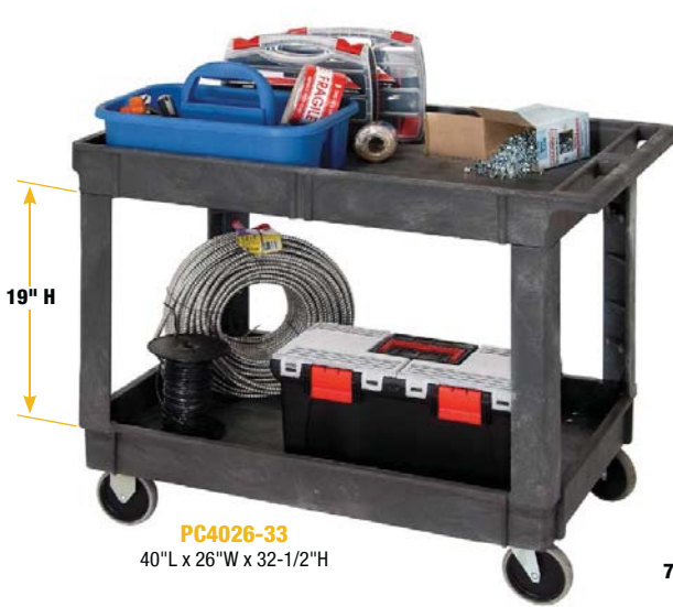
PC4026-33 40"L x 26"W x 32-1/2"H