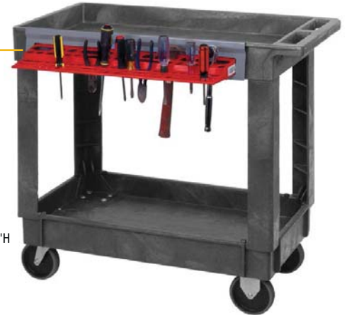
PC3518-33 + PCTH 34-1/4"L x 17-1/2"W x 32-1/2"H Shown with optional Tool Holder (Tools not included)

Shown with optional Tool Holder Attachment