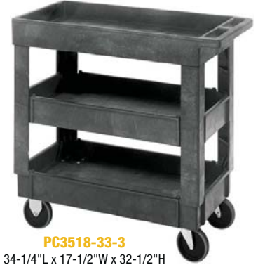
PC3518-33-3 34-1/4"L x 17-1/2"W x 32-1/2"H