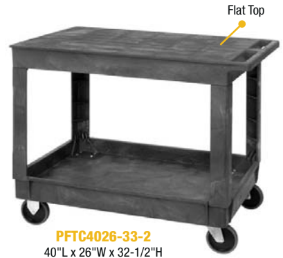
PFTC4026-33-2 40"L x 26"W x 32-1/2"H