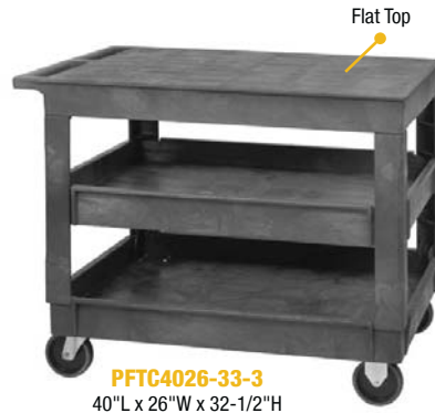
PFTC4026-33-3 40"L x 26"W x 32-1/2"H