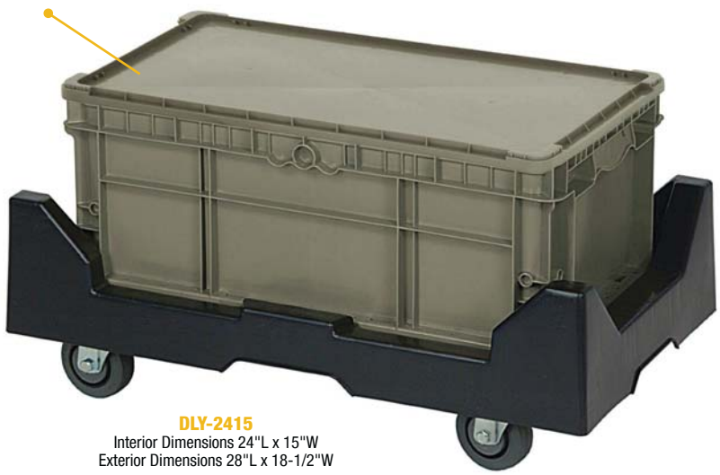
DLY-2415 Interior Dimensions 24"L x 15"W Exterior Dimensions 28"L x 18-1/2"W