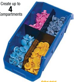
QP1265 Shown with optional Dividers CD1265/LD1265