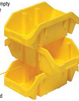
CROSS STACK 'EM

Built-in stacking ledges allow secure stacking and cross stacking