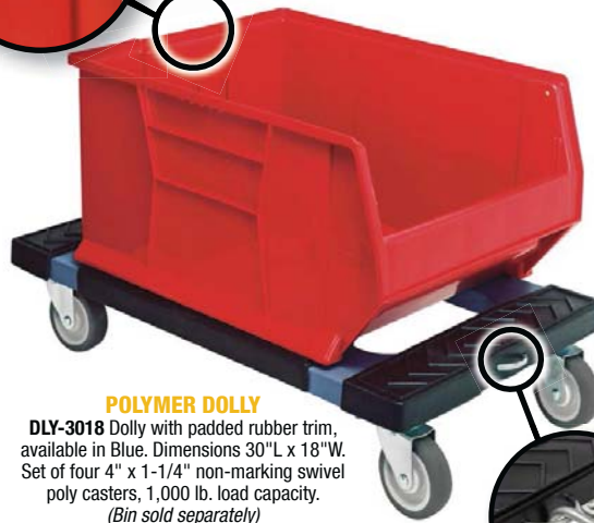
POLYMER DOLLY DLY-3018 Dolly with padded rubber trim, available in Blue. Dimensions 30"L x 18"W. Set of four 4" x 1-1/4" non-marking swivel poly casters, 1,000 lb. load capacity. (Bin sold separately)