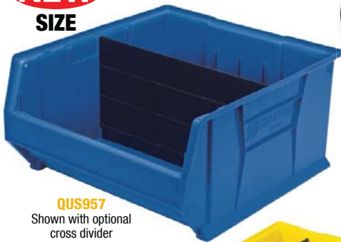
QUS957 Shown with optional cross divider