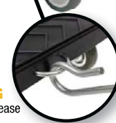
ATTACHED PULL RING allows dolly to be pulled with ease