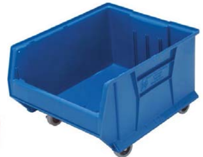
MOBILE HULK CONTAINER Ideal for transport of heavy and bulky parts. Bin comes with 4 swivel, 3" polyurethane casters, all with brakes, allowing up to 250 lb. mobile load capacity