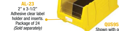
AL-23 2" x 3-1/2" Adhesive clear label holder and inserts. Package of 24 (Sold separately)

REAR LARGE HANDLE Molded onto back of containers makes them easy to carry!