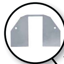
TK-EP Track End Plate (4 per kit)