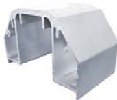
TRACK WITHOUT END PLATE