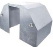
TRACK WITH END PLATE