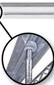
TK-CBW Track Roller Included with Mobile kit (4 per kit)