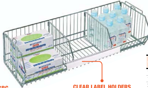
1436BC Shown with Dividers and Clear Label Holder (Sold separately)

Offer a variety of storage, display, and mobile supply applications. Dividers can be used to separate product. Accessible front and a wide selection of sizes allow for all types of product to be used from storage to display. (Dividers sold separately) Finish: Chrome