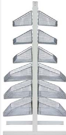
WS-DS36HC Shown with Baskets (Sold separately)