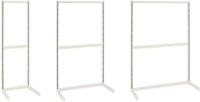
WS70-SS18HC WS70-SS36HC WS70-SS48HC

Starter units come complete with two uprights and three tie-bars.