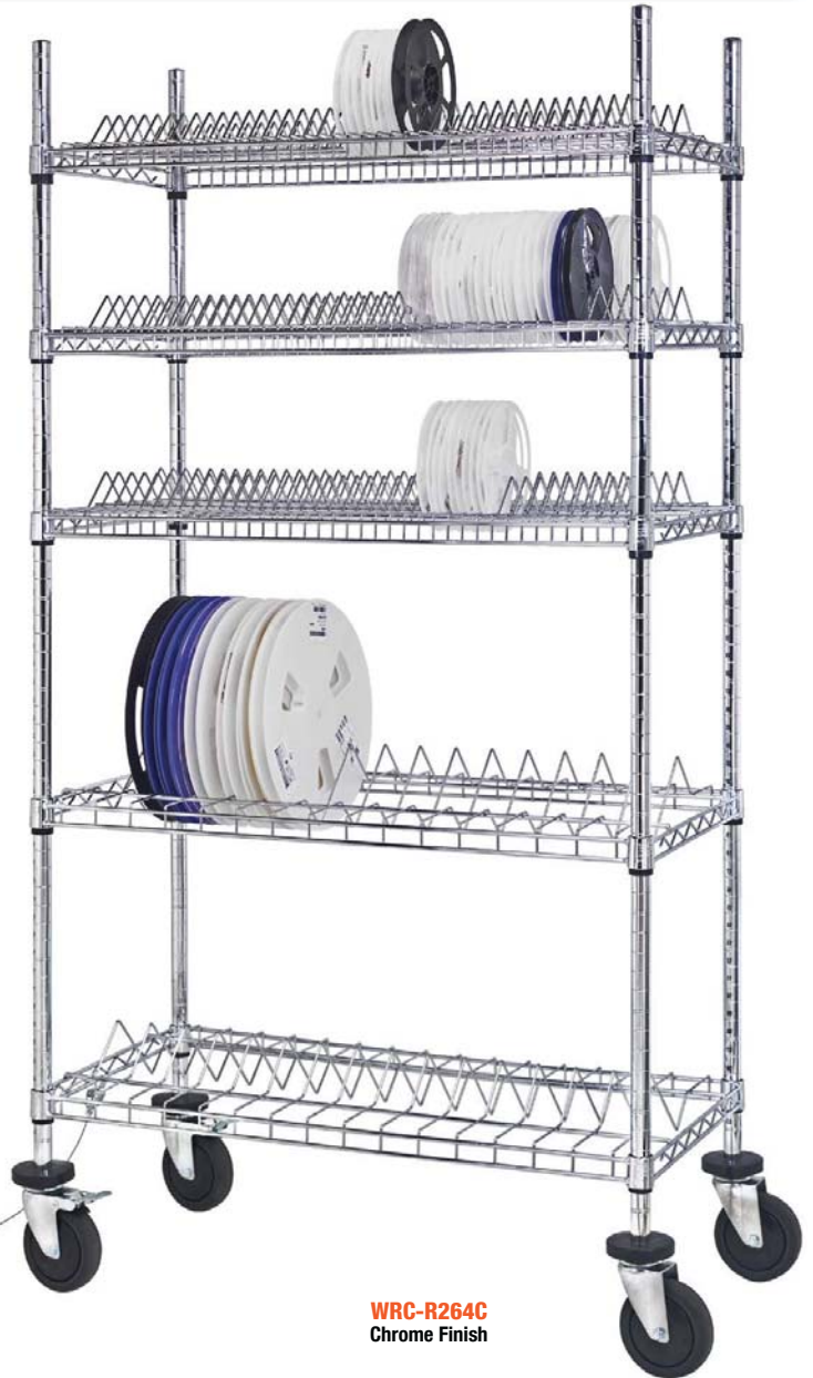
WRC-R264C Chrome Finish