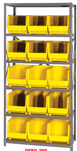
QSBU-260 18"D x 36"W x 75"H 6 shelves and 15 QUS260 18"L x 11"W x 10"H bins (Windows and dividers sold separately)