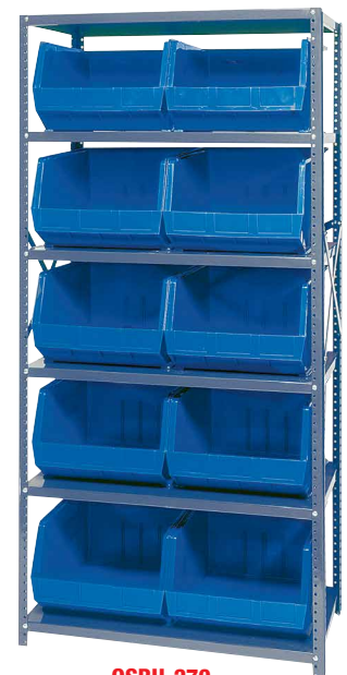
QSBU-270 18"D x 36"W x 75"H 6 shelves and 10 QUS270 18"L x 16-1/2"W x 11"H bins