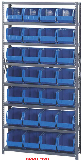
QSBU-239 12"D x 36"W x 75"H 8 shelves and 28 QUS239 10-3/4"L x 8-1/4"W x 7"H bins