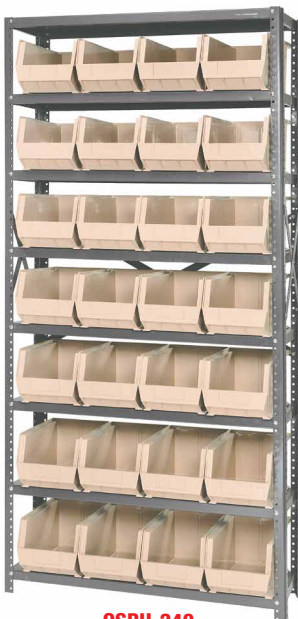
QSBU-240 12"D x 36"W x 75"H 8 shelves and 28 QUS240 14-3/4"L x 8-1/4"W x 7"H bins