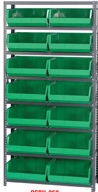
QSBU-250 12"D x 36"W x 75"H 8 shelves and 14 QUS250 14-3/4"L x 16-1/2"W x 7"H bins