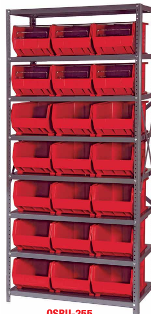
QSBU-255 18"D x 36"W x 75"H 8 shelves and 21 QUS255 16"L x 11"W x 8"H bins (Windows sold separately)