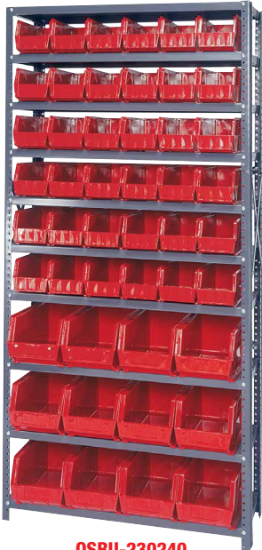
QSBU-230240 12"D x 36"W x 75"H 10 shelves and 36 QUS230 10-7/8"L x 5-1/2"W x 5"H bins and 12 QUS240 14-3/4"L x 8-1/4"W x 7"H bins