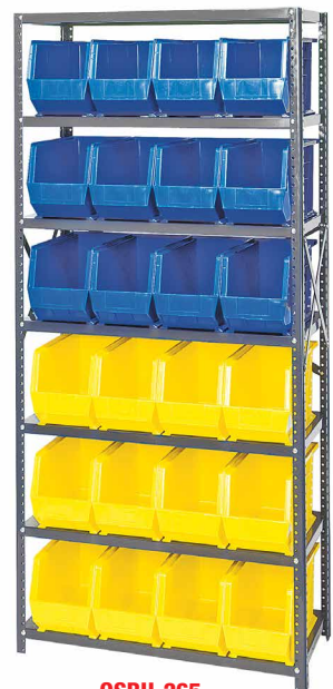
QSBU-265 18"D x 36"W x 75"H 7 shelves and 24 QUS265 18"L x 8-1/4"W x 9"H bins