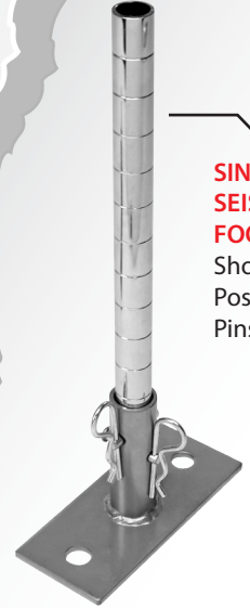
SINGLE SEISMIC FOOT PLATE Shown with Post and Pins