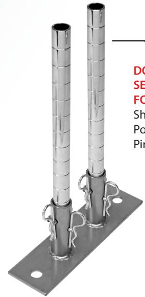
DOUBLE SEISMIC FOOT PLATE Shown with Posts and Pins