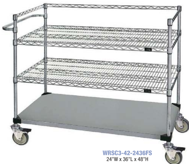
WRSC3-42-2436FS 24"W x 36"L x 48"H