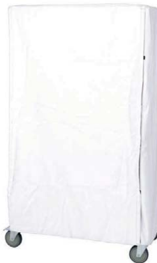
RACK AND CART COVERS Protect against pilferage, airborne dust, moisture and other contaminants.