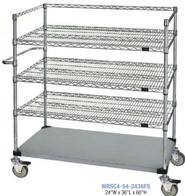
WRSC4-54-2436FS 24"W x 36"L x 60"H