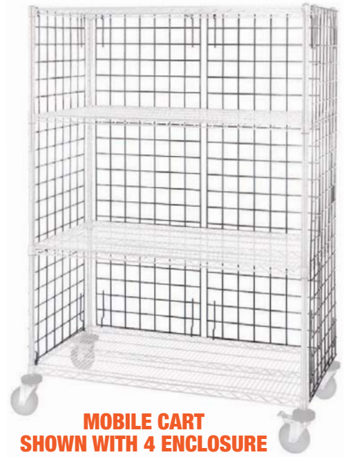
MOBILE CART SHOWN WITH 4 ENCLOSURE PANELS. MOBILE ENCLOSURE CARTS AVAILABLE