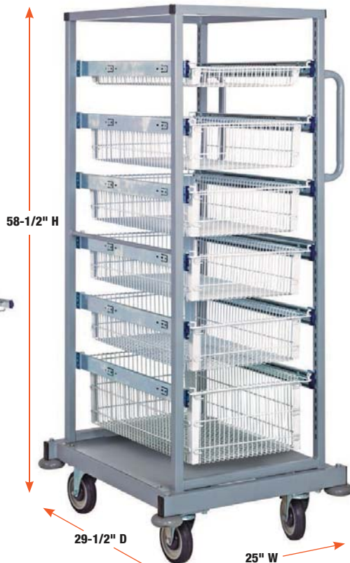
PS-SBC58-6WB Single Bay Cart with Wire Baskets 29-1/2"D x 25"W x 58-1/2"H 1 - 3" wire basket with 2 long and 2 short dividers 4 - 5" wire baskets with 2 long and 2 short dividers 1 - 8" wire basket with 2 long and 2 short dividers 25 - PS-LH3 clear hanging label tags