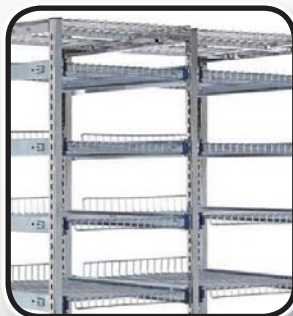
PS-A2475-7S Add-on with Wire Shelves