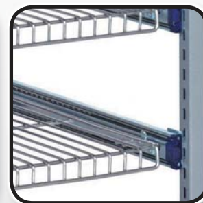
PS-WS2414 Wire Shelves Available in White or Chrome Finish