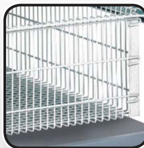
PS-WB22148 Wire Basket See pg. 126 for additional sizes