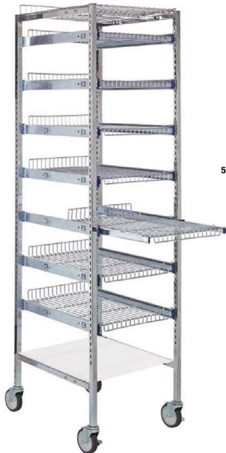
PS-S2475-7S Starter Unit with Wire Shelves 24"D x 19-1/2"W x 75"H 7 - wire shelves on slides 1 - bottom dust cover 25 - PS-LH3 clear hanging label tags

Starter units come complete with 2 frames, 4 cross bars, top wire shelf, full extension slides, bottom dust cover and four 4"H poly casters, 2 with brakes. Load capacity of 800 lb.