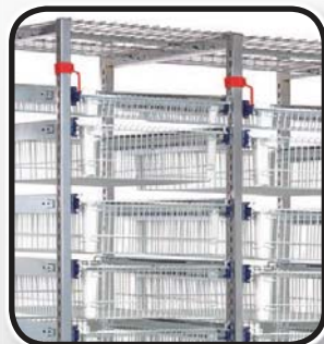
PS-A2475-8WB Add-on with Wire Baskets