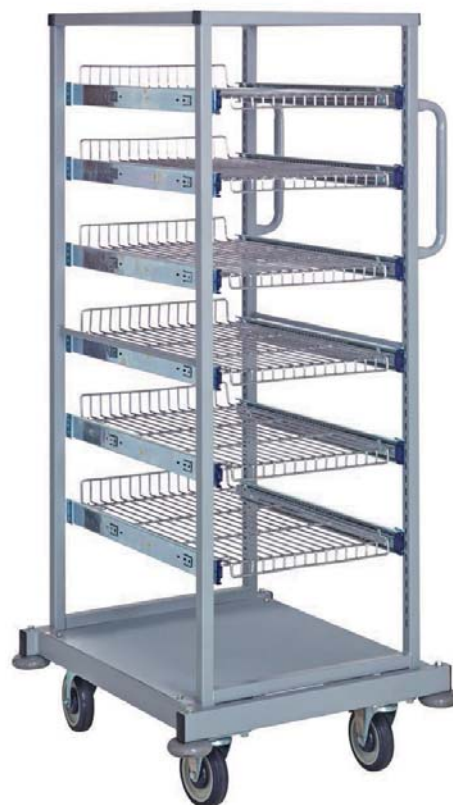
PS-SBC58-6S Single Bay Cart with Wire Shelves 29-1/2"D x 25"W x 58-1/2"H 6 - wire shelves 25 - PS-LH3 clear hanging label tags

EACH BASKET AND SHELF CAN SUPPORT 60 lbs.