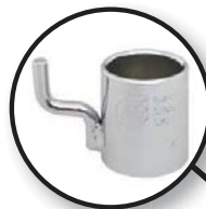
COLLAR HOOKS Baskets connect via collar hooks to post