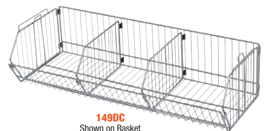
149DC Shown on Basket