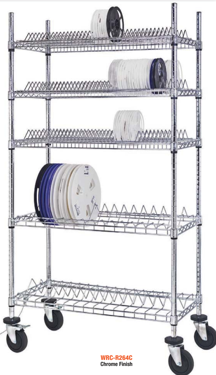
WRC-R264C Chrome Finish