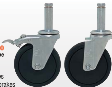
WR-SSCO Conductive Plastic Split Sleeves