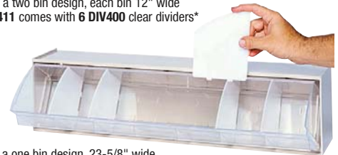
QTB412 QTB412 is a one bin design, 23-5/8" wide. Each QTB412 comes with 5 DIV400 clear dividers*

*Note: Dividers shown in white color for clarity