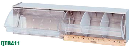
QTB411 QTB411 is a two bin design, each bin 12" wide. Each QTB411 comes with 6 DIV400 clear dividers*