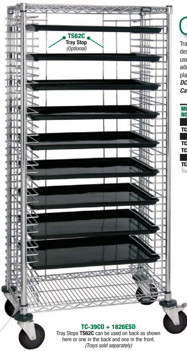
TC-39CO + 1826ESD Tray Stops TS62C can be used on back as shown here or one in the back and one in the front. (Trays sold separately)