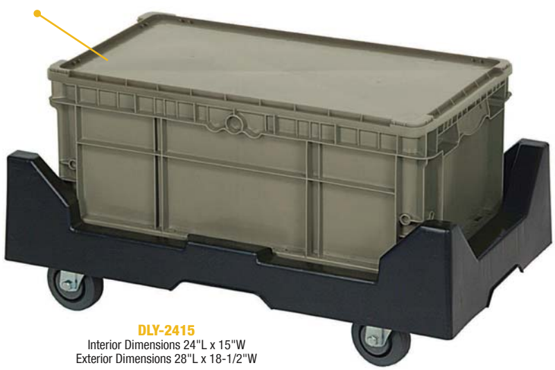
DLY-2415 Interior Dimensions 24" L x 15" W Exterior Dimensions 28" L x 18-1/2" W