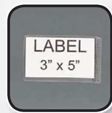
LABEL 3" x 5"

All nine sizes of totes have ability to use our optional 3" x 5" clear label holder. It securely attaches to tote with or without lid for easy part identification.