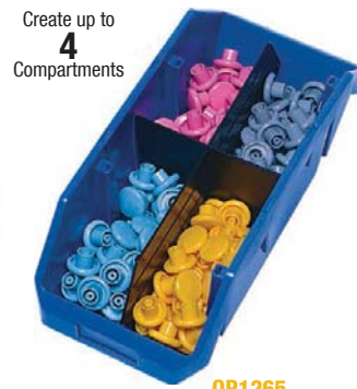
QP1265 Shown with optional Dividers CD1265/LD1265

Built-in stacking ledges allow secure stacking and cross stacking