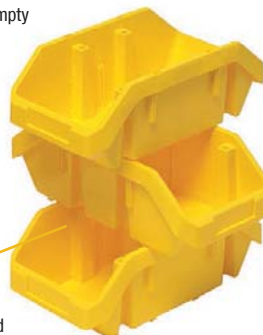
CROSS STACK 'EM

Built-in stacking ledges allow secure stacking and cross stacking