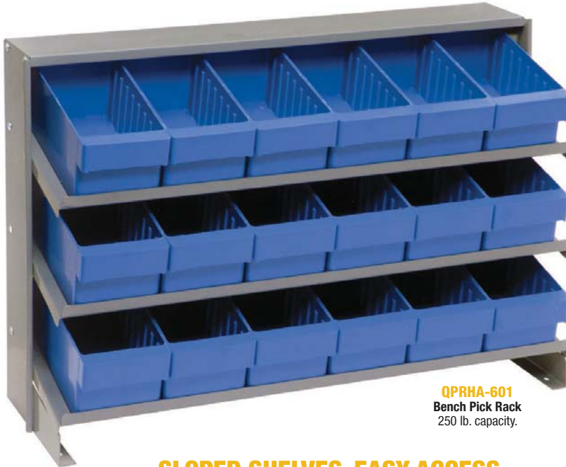
QPRHA-601 Bench Pick Rack 250 lb. capacity.

Sturdy steel racks with Super Tuff Euro Drawers create an efficient flow system. Sloped shelving provides easy access to stored items. Drawers can be removed from racks easily. These gray colored baked enamel, free standing racks assemble easily. Mobile unit has a 1,200 lb. capacity and is equipped with 2 swivel, 2 rigid casters. One drawer color per system.