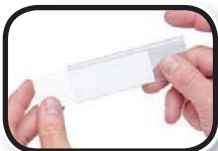
LTR-0813 Clear Label Holder and Insert Clear label holders and laser label inserts. Package of 25. Label holders fit all bins (except QSB100).