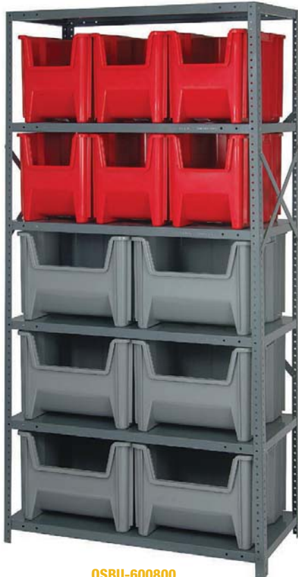
QSBU-600800 18"D x 36"W x 75"H 6 shelves, 6 QGH600 bins and 6 QGH800 bins