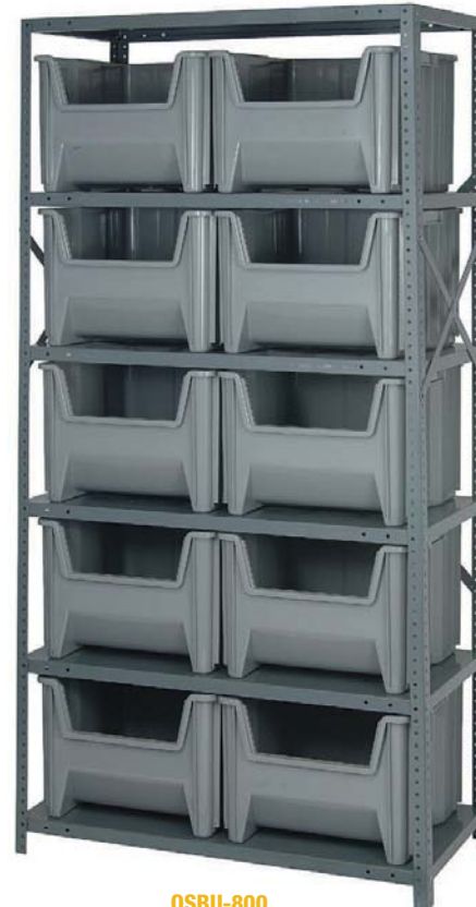
QSBU-800 18"D x 36"W x 75"H 6 shelves and 10 QGH800 bins

QGH700 available in: Blue Ivory Red Black Gray Clear