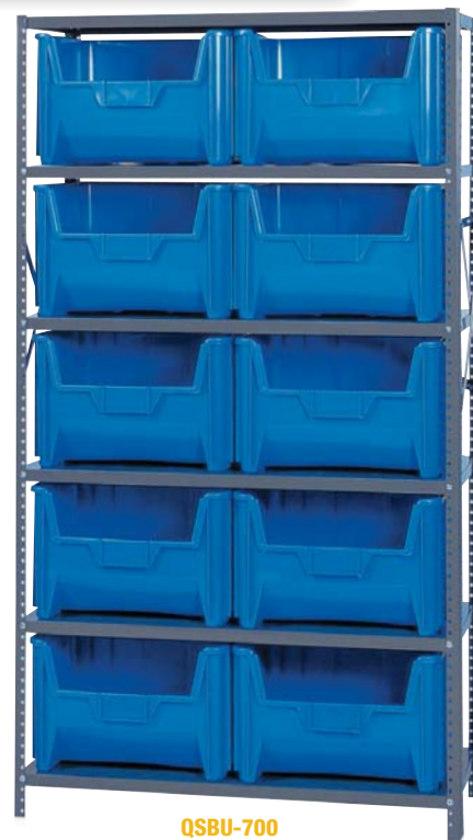
QSBU-700 18"D x 42"W x 75"H 6 shelves and 10 QGH700 bins