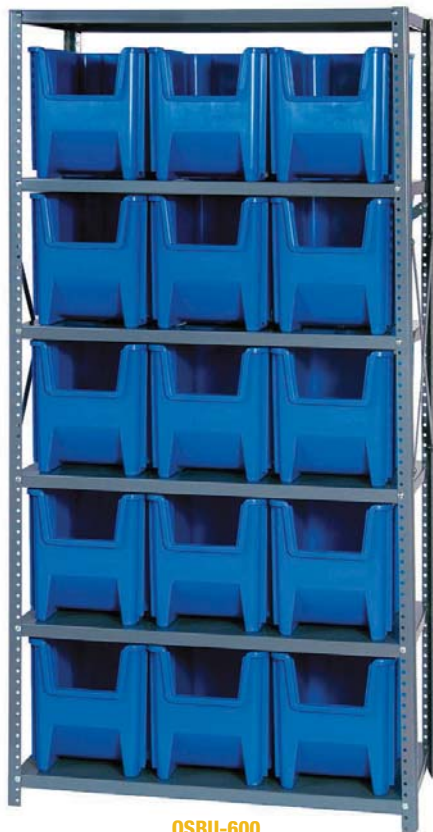
QSBU-600 18"D x 36"W x 75"H 6 shelves and 15 QGH600 bins