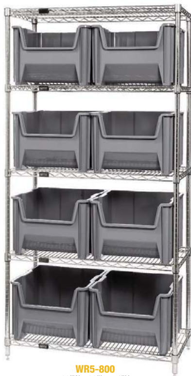
WR5-800 18"W x 36"L x 74"H 5 shelves and 8 QGH800 17-1/2"L x 16-1/2"W x 12-1/2"H bins