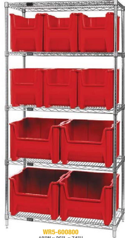
WR5-600800 18"W x 36"L x 74"H 5 shelves and 6 QGH600 17-1/2"L x 10-7/8"W x 12-1/2"H bins and 4 QGH800 17-1/2"L x 16-1/2"W x 12-1/2"H bins