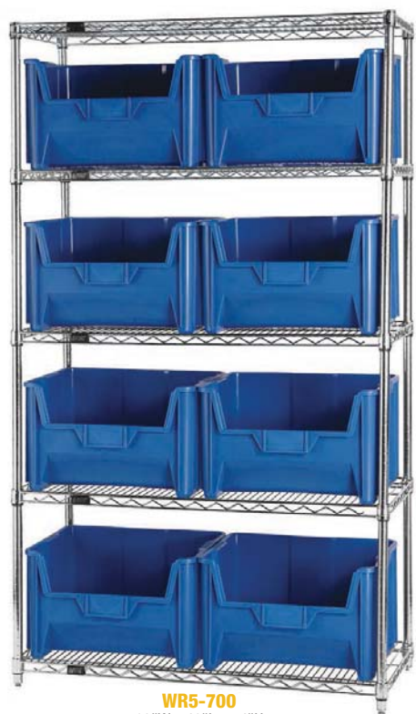
WR5-700 18"W x 42"L x 74"H 5 shelves and 8 QGH700 15-1/4"L x 19-7/8"W x 12-7/16"H bins