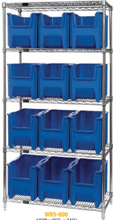
WR5-600 18"W x 36"L x 74"H 5 shelves and 12 QGH600 17-1/2"L x 10-7/8"W x 12-1/2"H bins