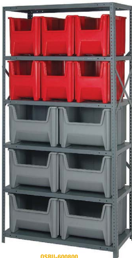
QSBU-600800 18"D x 36"W x 75"H 6 shelves, 6 QGH600 bins and 6 QGH800 bins