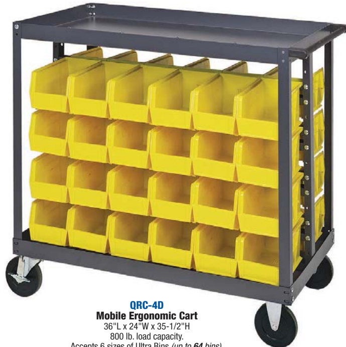
QRC-4D Mobile Ergonomic Cart

36"L x 24"W x 35-1/2"H 800 lb. load capacity. Accepts 6 sizes of Ultra Bins (up to 64 bins). Includes 2 rigid and 2 swivel, with brake, hard rubber casters. (Bins sold separately)