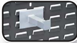
WS-HDS6 Heavy-Duty 6" Spike 65 lb. load capacity