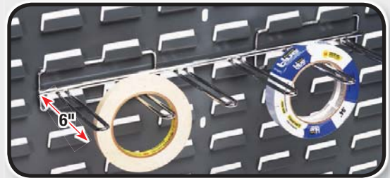
WS-HTH Horizontal Tape/Reel Holder 25 lb. load capacity