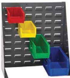
QBR-1819 18" L X 8" W x 19" H Accepts all sizes of Ultra and Mesh Bins. 140 lb. load capacity. (Bins sold separately)