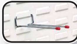
WS-DR10C 10" Double Rod 15 lb. load capacity