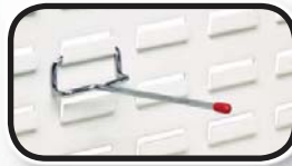
WS-SR9C 9" Single Rod 15 lb. load capacity