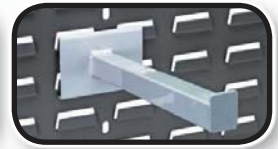
WS-HDS12 Heavy-Duty 12" Spike 50 lb. load capacity