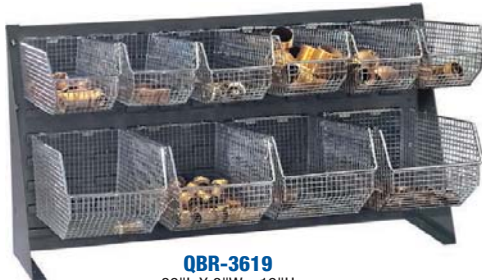
QBR-3619 36" L X 8" W x 19" H Accepts all sizes of Ultra and Mesh Bins. 150 lb. load capacity. (Bins sold separately)