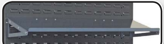
SLP-A1236 (12"D x 36"W) and SLP-A1836 (18"D x 36"W) Slanted Shelf with 2 Slanted Brackets. Available in 12" or 18" Depth. 75 lb. load capacity