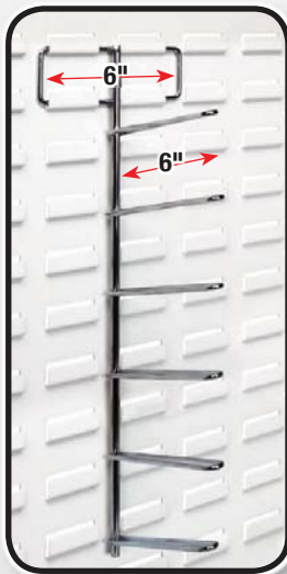
WS-VTH Vertical Tape/Reel Holder 25 lb. load capacity