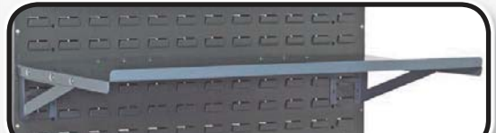
SLP-1236 (12"D x 36"W) and SLP-1836 (18"D x 36"W) Flat Shelf with 2 Brackets. Available in 12" or 18" Depth. 75 lb. load capacity