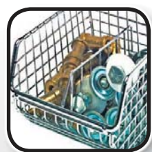
Shown with optional Divider (Sold separately)