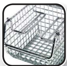
Shown with optional Side Stacking Ledge Pair (Sold separately)