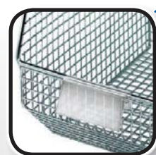
Shown with optional HBL3C Clear Label Holder Fits 1-1/8" x 3" Label (Sold separately)

INSTANT VISIBILITY NO DUST OR DIRT BUILDUP ALL WELDED