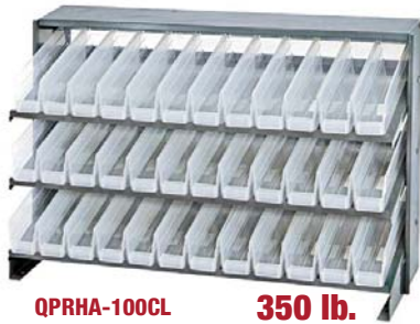
QPRHA-100CL 350 lb. LOAD CAPACITY