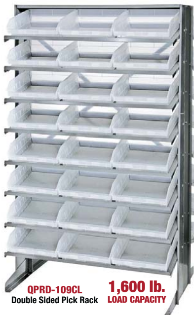
QPRD-109CL Double Sided Pick Rack 1,600 lb. LOAD CAPACITY