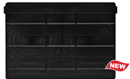
CRDUS270 Cross Divider