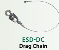
ESD-DC Drag Chain

CONVERT STANDARD WIRE SHELVING INTO CONDUCTIVE SHELVING WITH THESE ACCESSORIES THAT ARE INCLUDED WITH THESE PACKAGES