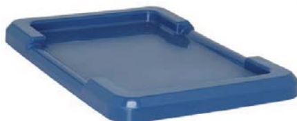
LID2516-8 Optional lid keeps stored items dust free. Tubs can still stack or cross stack with lids in place.