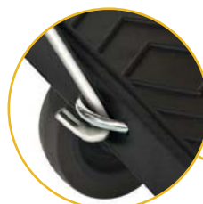
ATTACHED PULL RING allows dolly to be pulled with ease