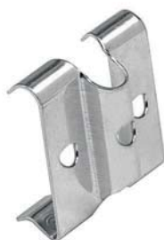
QSRT Side or Solid Shelf Tab