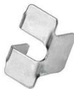
QAT Front or Back Tab