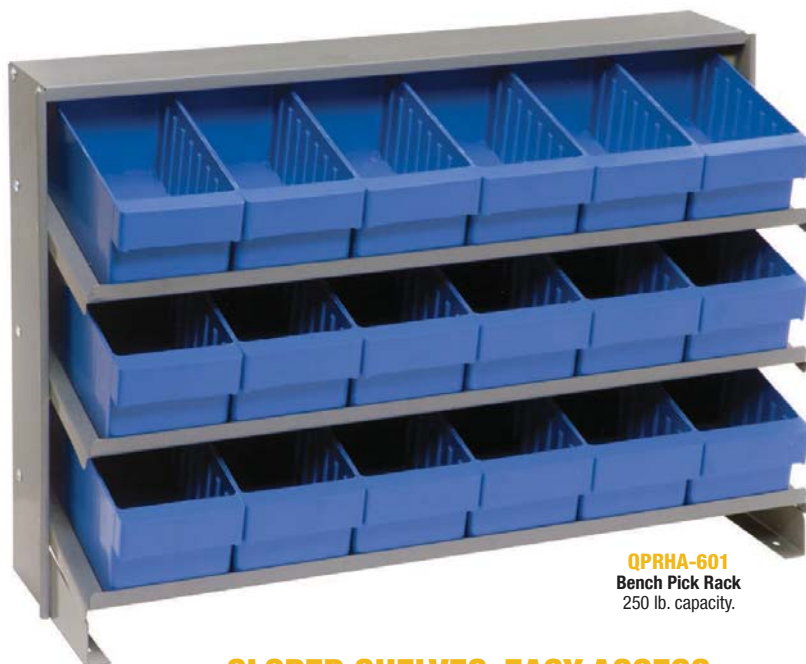
QPRHA-601 Bench Pick Rack 250 lb. capacity.

Sturdy steel racks with Super Tuff Euro Drawers create an efficient flow system. Sloped shelving provides easy access to stored items. Drawers can be removed from racks easily. These gray colored baked enamel, free standing racks assemble easily. Mobile unit has a 1,200 lb. capacity and is equipped with 2 swivel, 2 rigid casters. One drawer color per system.