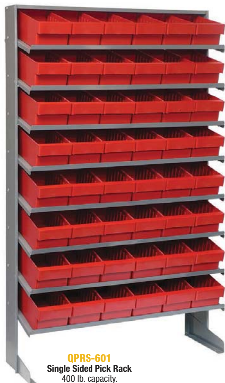
QPRS-601 Single Sided Pick Rack 400 lb. capacity.

SLOPED SHELVES, EASY ACCESS, MOST POPULAR AND VERSATILE STORAGE SYSTEMS SOLD