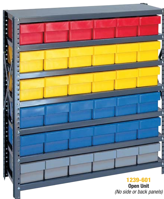
1239-601 Open Unit (No side or back panels)