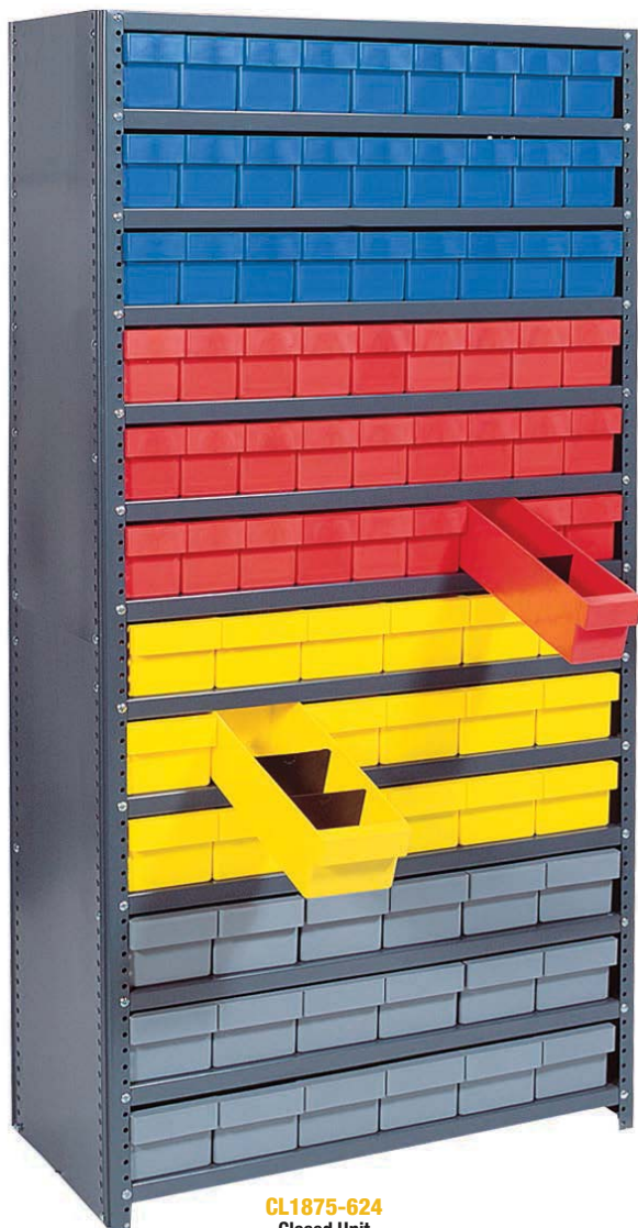
CL1875-624 Closed Unit (Complete with side and back panels)

Save time locating parts using our tough Euro Drawers with our sturdy open or closed steel shelving. 36" wide x 75" or 39" high units offer heavy-duty, high grade shelving with a 400 lb. capacity per shelf. Closed shelving provides a dust free environment for stored parts.