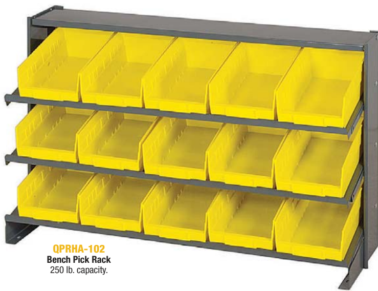
QPRHA-102 Bench Pick Rack 250 lb. capacity.

Pick Racks provide a convenient high density, easy access, sloped shelving system, available as bench units, single, and double sided free standing and mobile units. Units come complete with Economical 4" Shelf Bins. Sloped shelving unit keeps small and medium sized parts easily accessible. Open hopper front bins with label area, provide fast access to stored items. This all-in-one unit is easy to clean and will not rust or corrode. See chart for configurations. One bin color per unit.