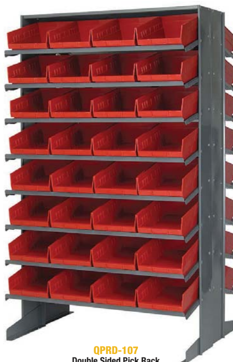
QPRD-107 Double Sided Pick Rack 800 lb. capacity.