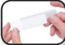
LTR-0813 Clear Label Holder and Insert Clear label holders and laser label inserts. Package of 25. Label holders fit all bins (except QSB100).