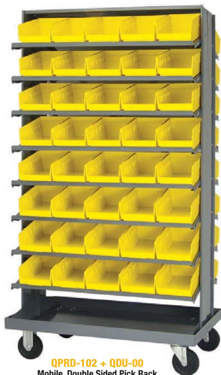
QPRD-102 + QDU-00 Mobile, Double Sided Pick Rack 1,200 lb. load capacity. 2 rigid, 2 swivel with brake hard rubber casters.