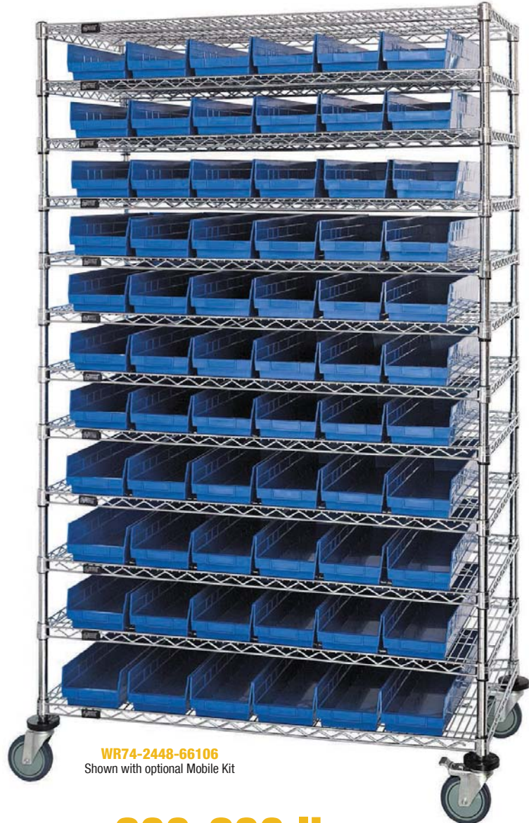
WR74-2448-66106 Shown with optional Mobile Kit