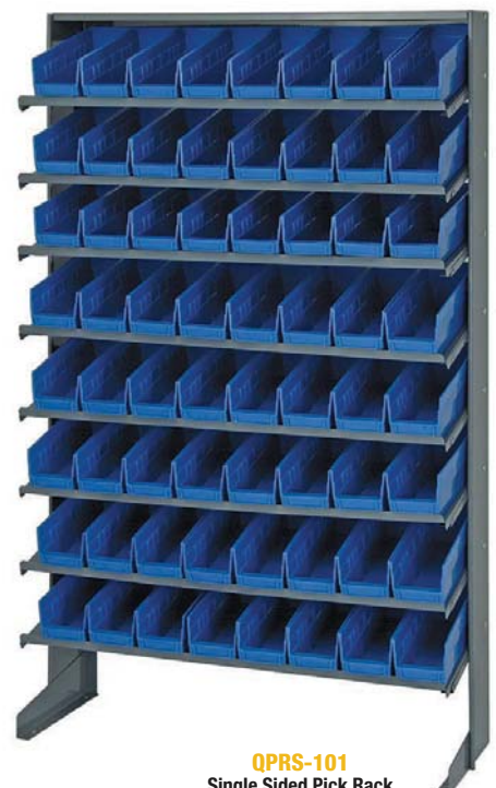
QPRS-101 Single Sided Pick Rack 400 lb. capacity.