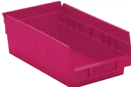
Pink color in select sizes