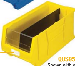
QUS953 Shown with optional divider, window front, adhesive label holder and insert

AL-23 2" x 3-1/2" Adhesive clear label holder and inserts. Package of 24 (Sold separately)