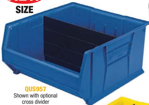
QUS957 Shown with optional cross divider

AL-23 2" x 3-1/2" Adhesive clear label holder and inserts. Package of 24 (Sold separately)