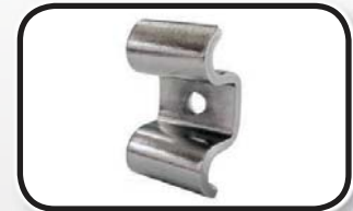
WLP-DMC Direct Mount Clips - 4 pack (Included with wire louvered panels) Extra packages available ( if needed ). ( Sold separately )