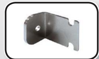
WLP-OSC Offset Mount Clips - 4 pack Offsets panel from wall surface allowing easy access to clean behind panel ( Sold separately )