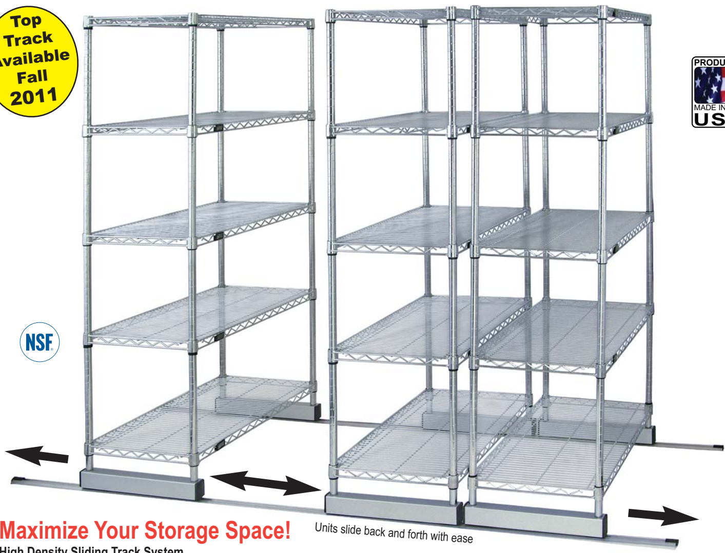
Units slide back and forth with ease