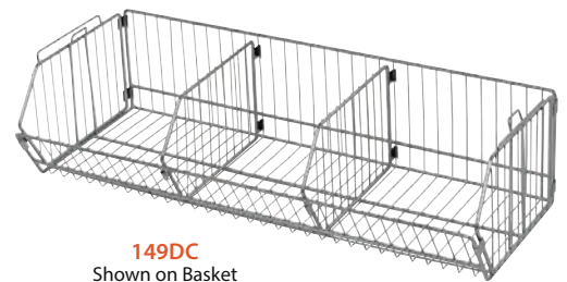
149DC Shown on Basket