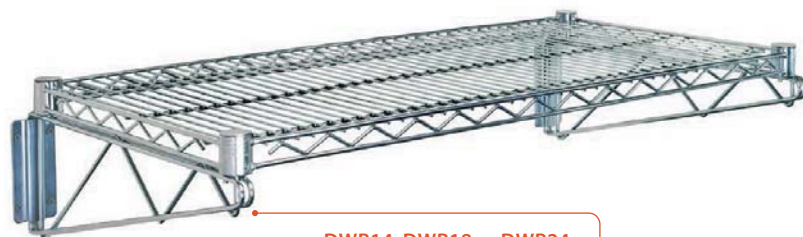
MOUNTING BRACKET DWB14, DWB18 or DWB24 Wire Cantilever Arm