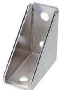
PWB Post Mount Bracket Used to secure cantilever post mount units and free standing shelving units to wall. Sold in a pack of 4. (Mounting Screws are not included)