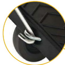
ATTACHED PULL RING allows dolly to be pulled with ease