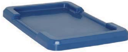
LID2516-8 Optional lid keeps stored items dust free. Tubs can still stack or cross stack with lids in place.