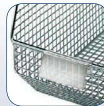
Shown with optional HBL3C Clear Label Holder Fits 1-1/8" x 3" Label (Sold separately)

INSTANT VISIBILITY NO DUST OR DIRT BUILDUP ALL WELDED