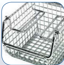
Shown with optional Side Stacking Hangers (Sold separately)