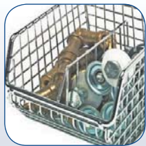
Shown with optional Divider (Sold separately)